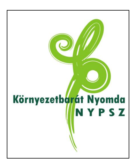
Figure 1. Proposal for trademark "eco-friendly printing" title (English and Hungarian).